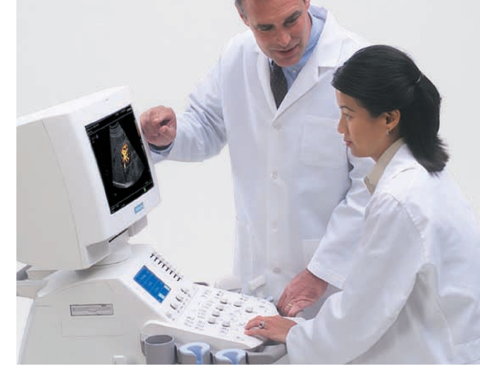
SONOLINE G50 Ultrasound System Defining the value of all-digital ultrasound

Siemens and SONOLINE are registered trademarks and G50, MultiHertz, SuppleFlex, DIMAQ-IP, SieScape, QuickSets, Evolve Package and microCase are trademarks of Siemens. Windows is a registered trademark of Microsoft Corp.